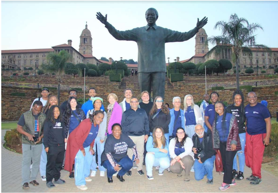
Fulbright Group @ Union Building in Pretoria